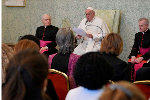
Pope Francis reads his speech to a delegation representing the “Sentinelles de la Sainte Famille” (Sentinels of the Holy Family), an association of laywomen dedicated to the Holy Family and prayer, during an audience at the Vatican Jan. 11, 2024.

“May your growth, numerical and geographical, not cause you to lose simplicity and smallness of heart,” he added.